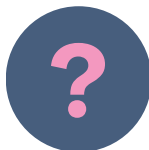
Open Position Marketing Director

TO INQUIRE ABOUT SPONSORSHIPS, EMAIL US AT HELLO@HOUSTONCREMM.COM