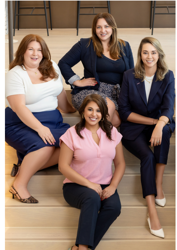
Collaboration and trust, built through CREMM

“WE DON'T WASTE TIME FINDING VENDORS. WE ALREADY KNOW THE BEST PEOPLE- BECAUSE WE'RE IN CREMM WITH THEM.”