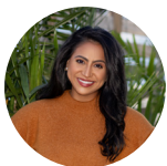
Candi Poisl Photographer P3 Photography